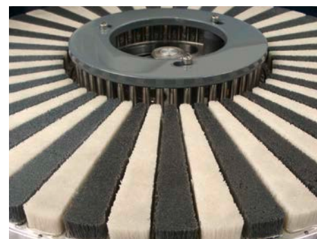
Lower brushing wheel of the AC 700-D for double-side deburring of flat work pieces