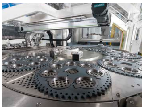
View into the Twin Loader – for shortest carrier exchange time